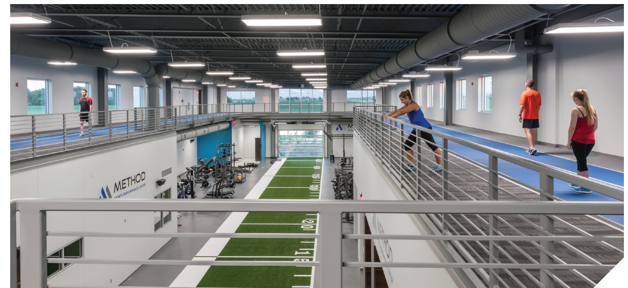
Center for Integrated Wellness Bloomington, Illinois

The Maryland Proton Treatment Center marks the second proton therapy project developed by Signet. The project's clinical partner, the University of Maryland, provides all clinical operations for the facility as an extension of its current radiation oncology services.