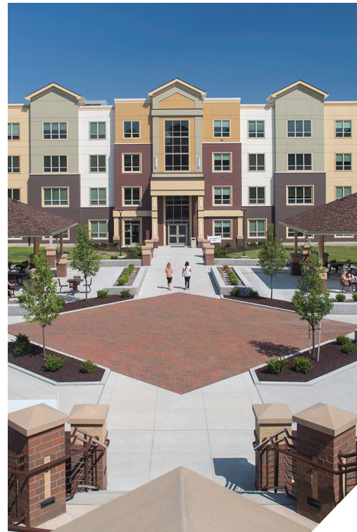
The Village at Northeast Ohio Medical University Rootstown, Ohio

Deacon Place is a collection of 10 garden-style buildings designed specifically for upperclass undergraduates and graduate students.