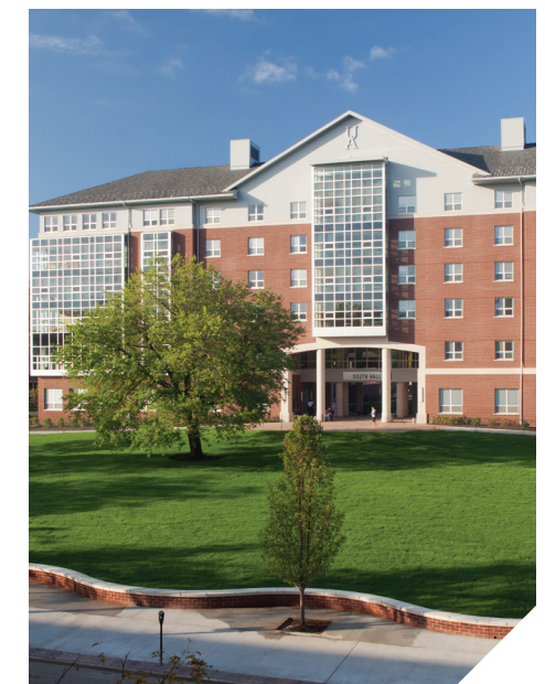
South Residence Hall University of Akron Akron, Ohio

Developed in partnership with the University of New Mexico, Lobo Rainforest is a six-story, 158,000-square-foot mixed-use innovation hub featuring apartment-style living. The residences are positioned over commercial and educational space and located in close proximity to the University of New Mexico campus.