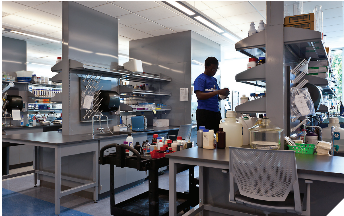
Stephen J. Kopp Hall School of Pharmacy Marshall University Huntington, West Virginia

The 49,500 square-foot, three-story facility includes research, pharmacological labs, instructional, communal and administrative areas. The location, just steps away from the Joan C. Edwards School of Medicine, allows for enhanced interdisciplinary education and the evolution of a true health sciences campus.