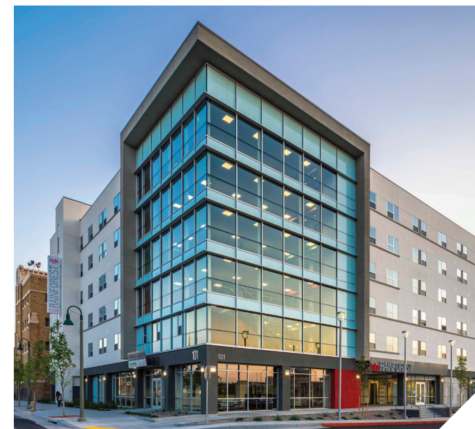
Lobo Rainforest University of New Mexico Albuquerque, New Mexico

The first residential public-private partnership of its kind with the University of Florida, Infinity Hall is located in the university's Innovation Square, an urban research district that cultivates innovation and strengthens the economic and cultural viability of the community.