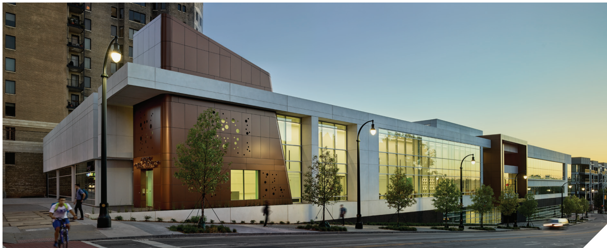
Emory Proton Treatment Center Atlanta, Georgia

The Spectrum Orthopaedics headquarters was the result of consolidating four offices into one convenient central location to provide a more comprehensive offering for Spectrum patients. The facility allows Spectrum to continue to deliver world-class orthopedic care to the residents of the Canton regional area.