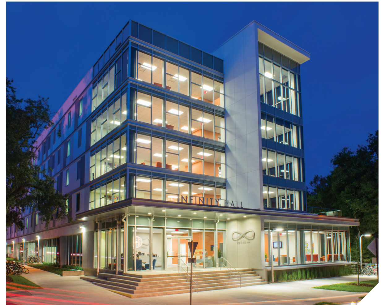
Infinity Hall University of Florida Gainesville, Florida

The first residential public-private partnership of its kind with the University of Florida, Infinity Hall is located in the university's Innovation Square, an urban research district that cultivates innovation and strengthens the economic and cultural viability of the community.