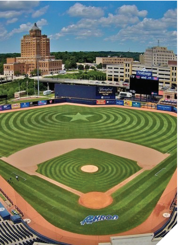
Canal Park Stadium Akron, Ohio

In partnership with the University of Kentucky, Signet is developing a five-story, mixed-use parking structure that includes over 900 new parking spaces and over 15,000 square feet of ground floor mixed-use and innovation space.