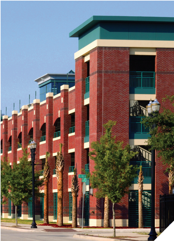
Jacksonville Parking Facilities Jacksonville, Florida

After learning of plans to potentially move the AA affiliate of the Cleveland Indians, Signet structured a deal with the owners of the Akron Rubber Ducks baseball franchise (Akron Aeros at the time) to bring the team to Akron and provide it with a new state-of-the-art facility.