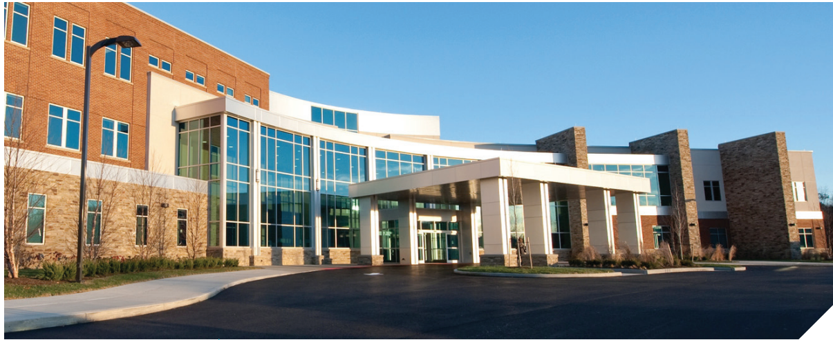
Summa Health Center at Lake Medina Medina, Ohio

From diagnostics to physician offices and same-day surgery, the Summa Health Center at Lake Medina serves the residents of Medina and surrounding communities. This facility offers comprehensive outpatient services, a physician medical office building, and an ambulatory surgery center. On-site diagnostics capabilities include radiology, mammography, CT scan, MRI, ultrasound, bone density testing, physical and occupational therapy, and lab services.