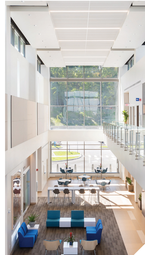
Brecksville Health and Surgery Center Brecksville, Ohio

Medical Office Facilities Ambulatory Facilities Assisted Living Facilities Standalone Specialty Centers In-Patient Hospitals Centers of Excellence Outpatient Facilities Hospital-Physician Joint Ventures Proton Cancer Treatment Centers Oncology Centers Health and Wellness Facilities