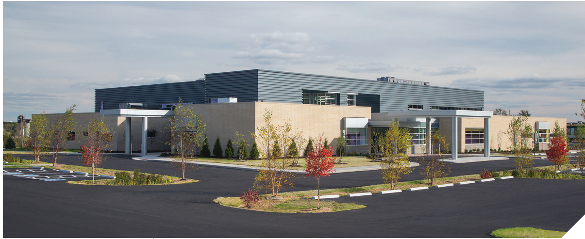
Spectrum Orthopaedics North Canton, Ohio

From diagnostics to physician offices and same-day surgery, the Summa Health Center at Lake Medina serves the residents of Medina and surrounding communities. This facility offers comprehensive outpatient services, a physician medical office building, and an ambulatory surgery center. On-site diagnostics capabilities include radiology, mammography, CT scan, MRI, ultrasound, bone density testing, physical and occupational therapy, and lab services.