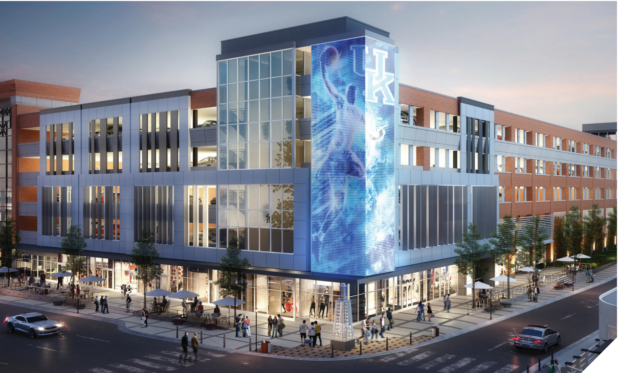
Mixed-Use Parking & Innovation Center Lexington, Kentucky

In partnership with the University of Kentucky, Signet is developing a five-story, mixed-use parking structure that includes over 900 new parking spaces and over 15,000 square feet of ground floor mixed-use and innovation space.