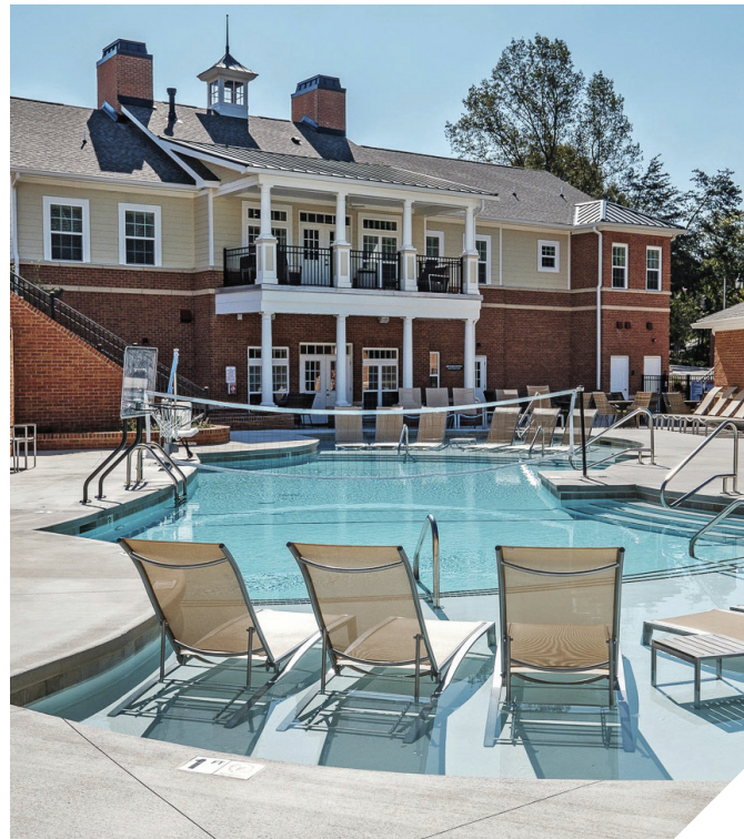
Deacon Place Wake Forest University Winston-Salem, North Carolina

The 49,500 square-foot, three-story facility includes research, pharmacological labs, instructional, communal and administrative areas. The location, just steps away from the Joan C. Edwards School of Medicine, allows for enhanced interdisciplinary education and the evolution of a true health sciences campus.